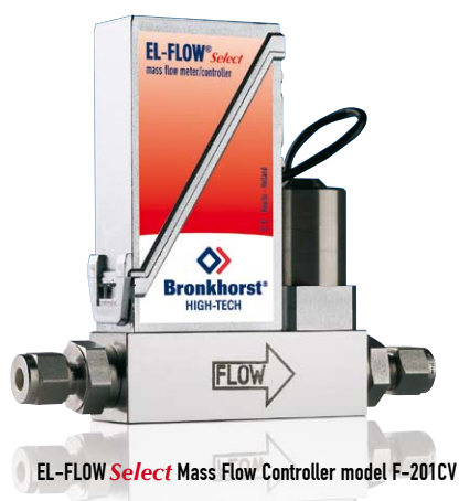
EL-FLOW Select Mass Flow Controller model F-201CV