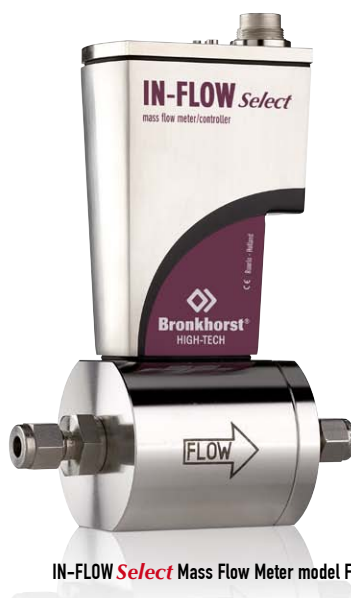
IN-FLOW Select Mass Flow Meter model F-112AI