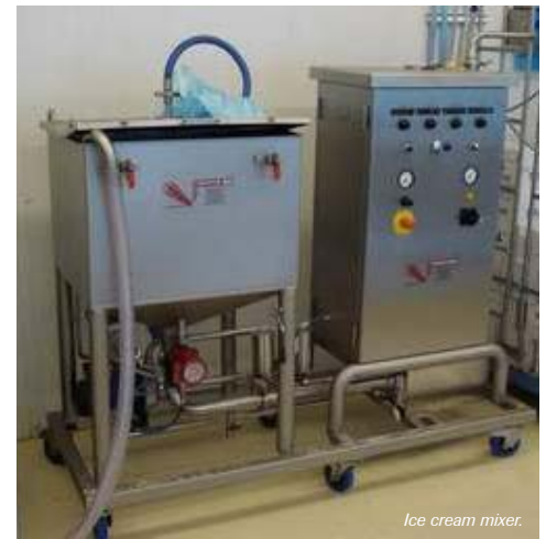
Ice cream mixer.