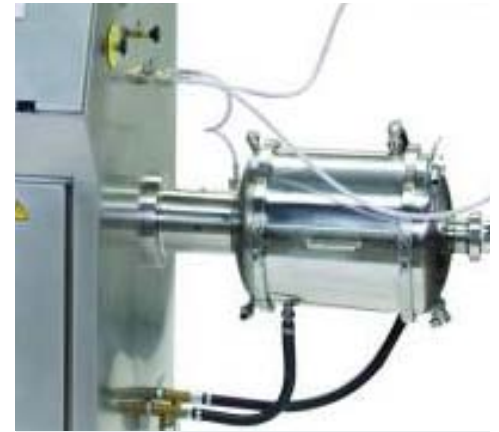
Continuous aeration mixer

The air content in ice cream (often called overrun) affects the taste, texture and appearance of the finished product. Higher aeration will produce a tastier and smoother ice cream. Thus, for attaining an optimal structure of the ice cream, production machines must possess an accurate air flow controller that is able to deliver the amount of air necessary to maintain the ratio between cream and air constant, as a function of the cream flow.